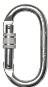
AZ 011 SCREW SNAP HOOK EN 362 CE

Ref.: AZ 011 Weight: 180 g Dimensions: 108 x 60 mm ZINC PLATED STEEL