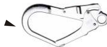
AZ 022 galvanized steel opening: 50 mm weight: 500 g