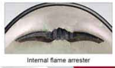
Internal flame arrester