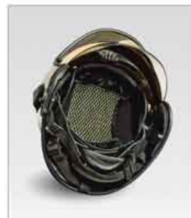
Adjustable antistatic net cradle

External Knob for size adjustment system (patented). No interference with neck protector. Easy to use even when wearing fire-fighting gloves. The required setting can be changed depending on the operation (tight for extreme situation, looser in less dangerous conditions)