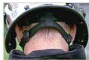
Adjustable fire proof trapezoidal chinstrap/neck-strap with leather chin-cup

third party on systems supported (request)