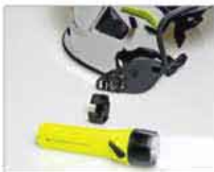
Torch holder support (detachable)