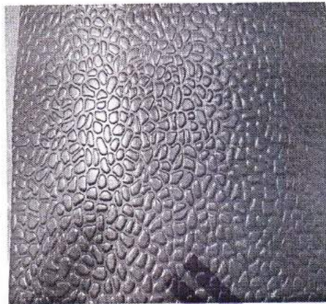
Figure 1: EUT