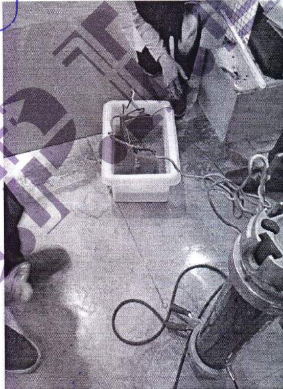
Figure 4: EUT before the withstand test

This report should not be reproduced in extracts without written approval by EPIL. Test results pertain to the tested sample only. Not Valid Without Lab Stamp.