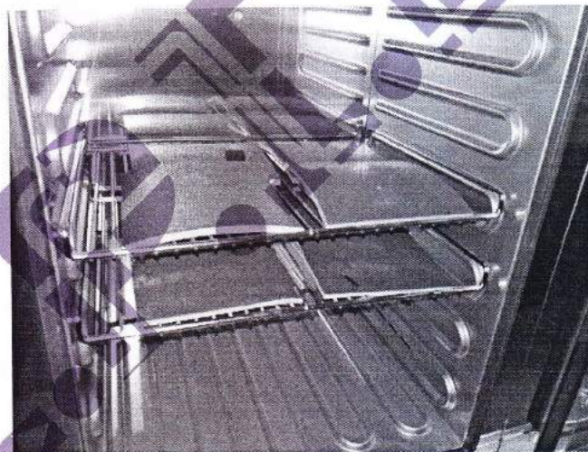
Figure 2: EUT after the thermal test