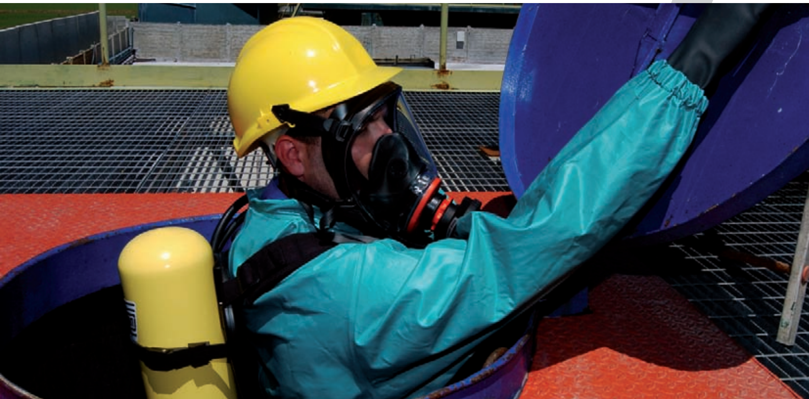
Breathing apparatus RN MK2 Type 1 used in confined spaces

Breathing apparatus isolate the operator from the surrounding environment allowing to work under extreme conditions. SPASCIANI proposes products studied for facing up to every emergency or routine intervention in full safety. There are many features which make the SPASCIANI SCBA unique, comparing to what the market offers, such as the warning device placed within the demand and audible in any circumstances, the longer autonomy, the possibility of walking away from the cylinder whilst keeping the warning device with you, a full face mask that can be used either with a demand valve and or filter. Those characteristics, among others, define the breathing apparatus RN MK2 of SPASCIANI as a technology advanced product.