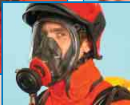
◀ TR2002 A: uso con autorespiratori. TR2002 A: use with B.A.