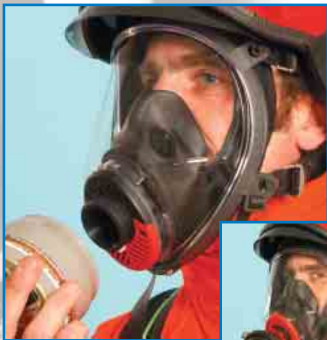
▲ TR2002 B/N: uso con filtri. TR2002 B/N: use with filters.

The masks moulded in silicone are named TR 2002 S A and TR 2002 S B/N .