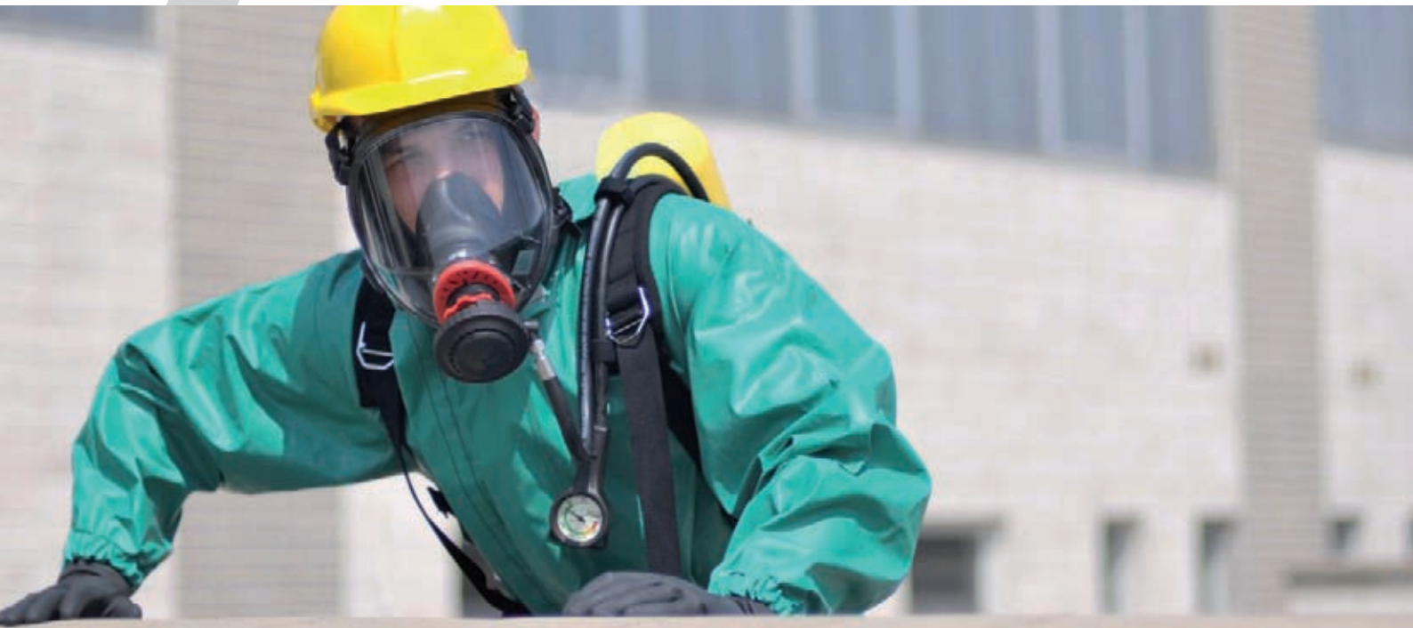
Operator wearing RN MK2 Type 1 with 6 l 300 bar steel cylinder in industrial environment

The wide range of components and accessories can create many settings for the SCBA which satisfy the different needs of every single client: padded harnesses and kidney belts to enhance comfort, fullface mask BN for using either the SCBA or filters, cylinders of different volumes to enhance autonomy and different material to reduce weight. Accessories as carrying cases, sleeves for cylinders, 4-way valves, etc complete the set.