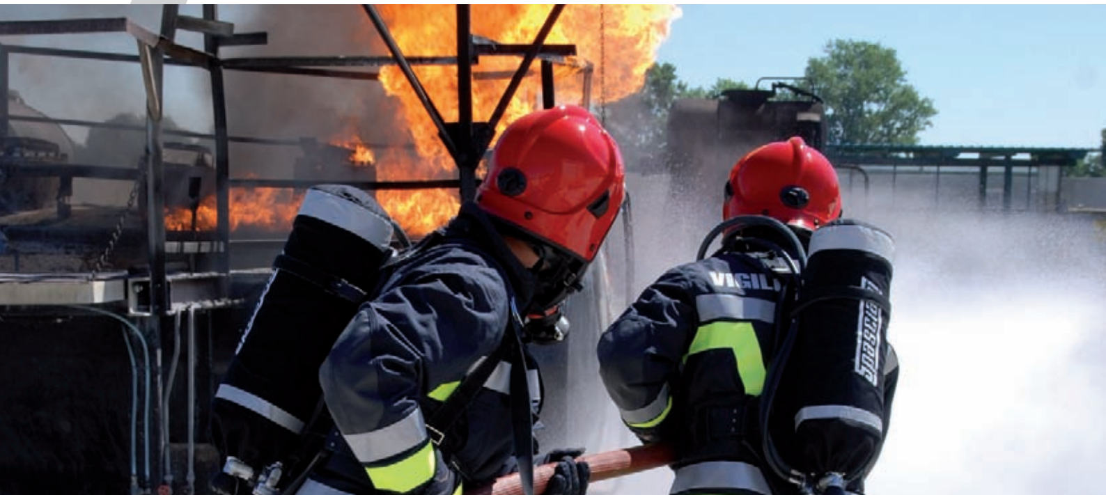
Two firefighter wear the RN MK2 type 2 with 6 l 300 bar composite cylinders and protective sleeve, during an intervention

Accessories as carrying cases, sleeves for cylinders, 4-way valves, etc complete the set.