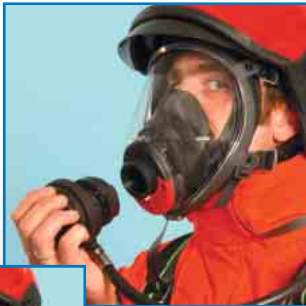
▲ TR2002 B/N: uso con autorespiratori. TR2002 B/N: use with B.A.