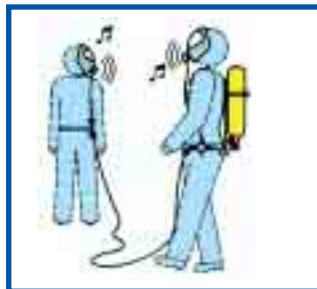
Alimentazione secondo operatore Feeding a second man