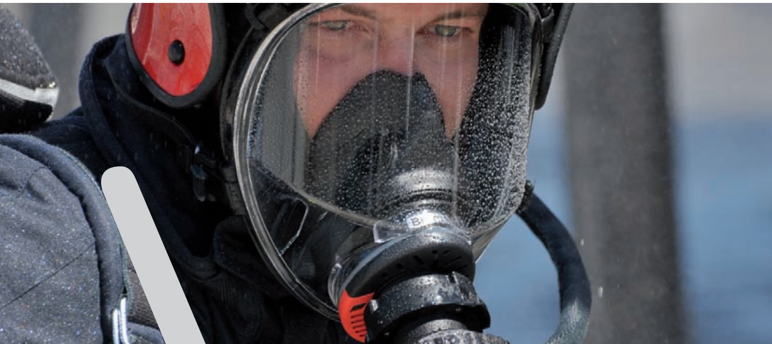
A Firefighter wears a TR2002 BN connected to a positive pressure device

The fullface mask is able to work both in negative and in positive pressure thanks to its special device, unique and patented, that recognizes automatically the system connected and pre-charges the mask valve when it is used with a positive pressure apparatus. The TR2002 BN can be used with breathing apparatus SPASCIANI with demand valve BN with bayonet quick connector in accordance to the norm DIN 58600. The mask can also be used with filters, e.g. like the SPASCIANI series 200 , or negative pressure respiratory devices with standard screw connector (EN 148-1).