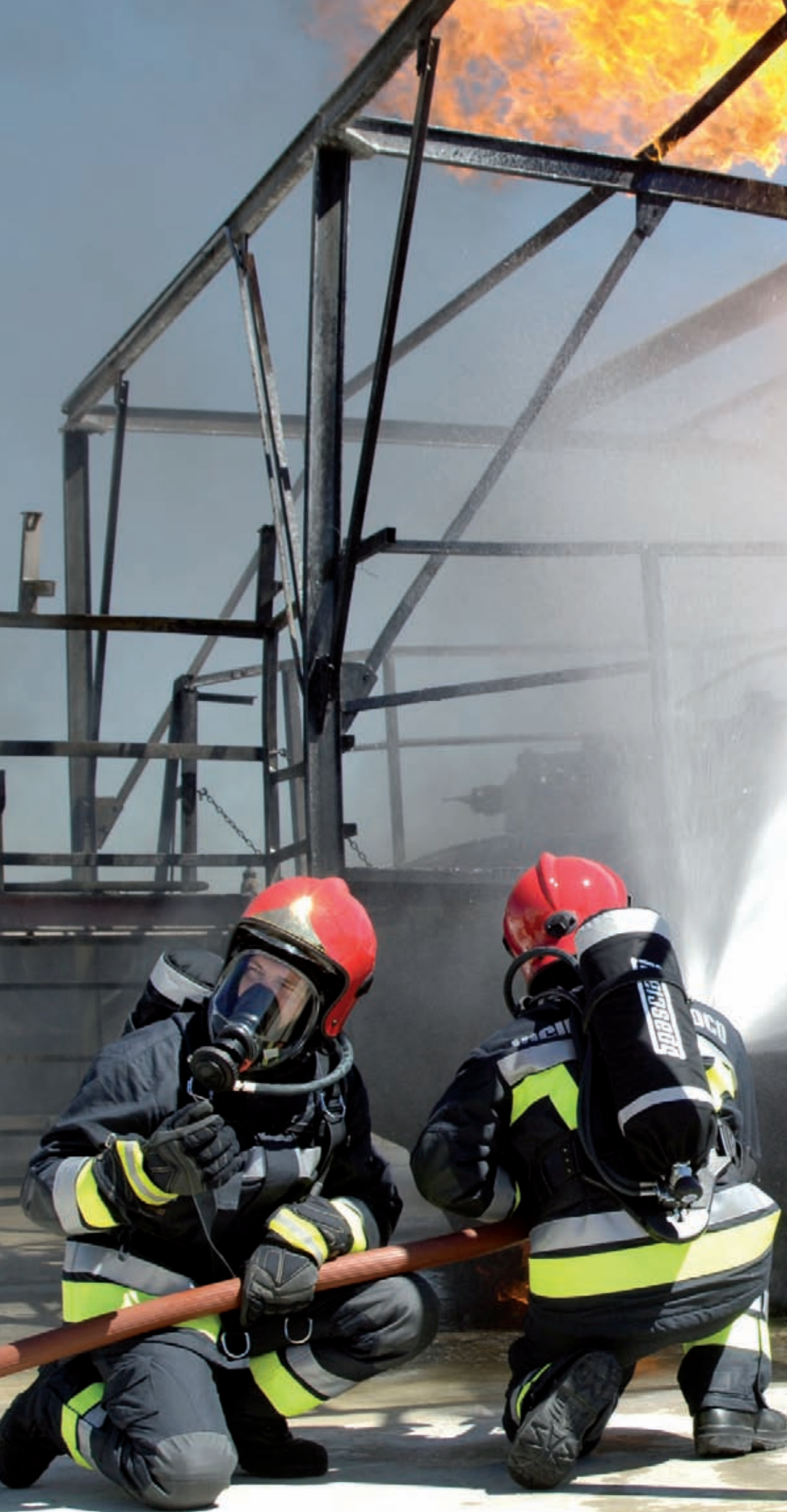
Firefighters wear RN MK2 Type2 during an intervention