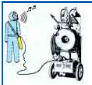
Carrellato RC in uso con BVF Wheeled RC in use with BVF