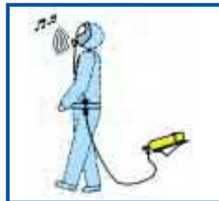
Usa a distanze Use at a distance