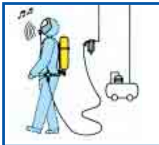
Alimentazione della linea Feeding from air line