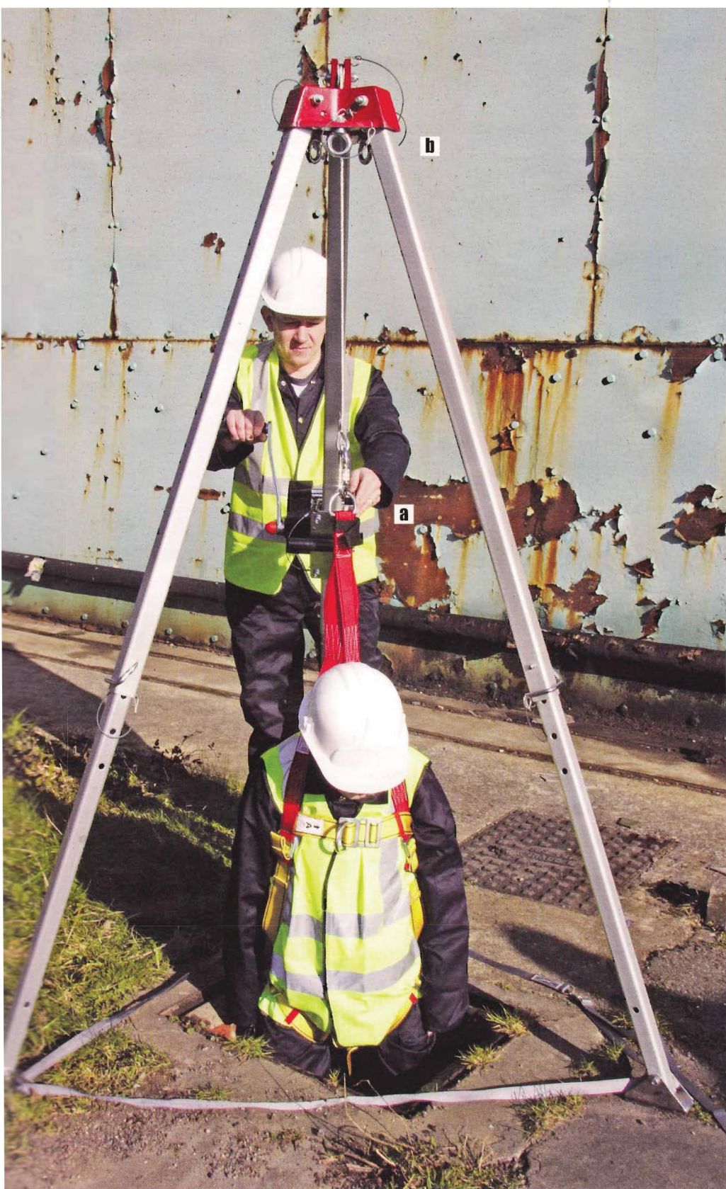
طریقه ی استفاده از سه پایه نجات